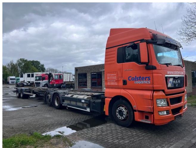
MAN TGX 26.440 XLX 6X2 + HANGER EURO 5 - BDF CHA...