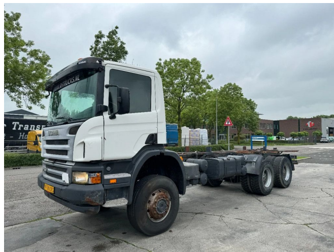
Scania P380 6X6 FULL STEEL AIRCO