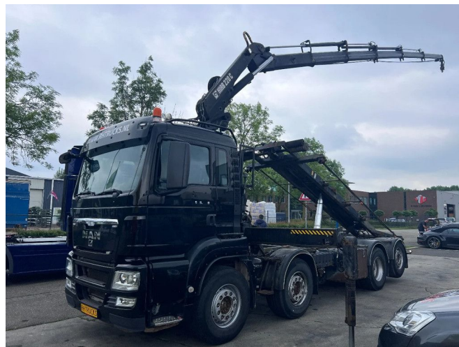
MAN TGS 35.440 8X2-4 + HIAB 220C-5 REMOTE + CABLE L... Referentienummer: MA055351