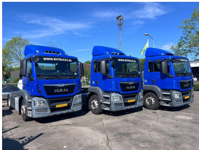
MAN TGS 18.320 4X2 EURO 6 - DAY CABINE - 425.609 KM