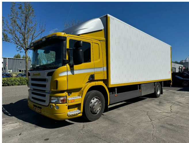
Scania P230 4X2 EURO 5 + BOX 7,88 METER