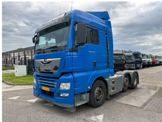
MAN TGX 26.460 XLX 6X2-2 EURO 6 LIFT AXLE