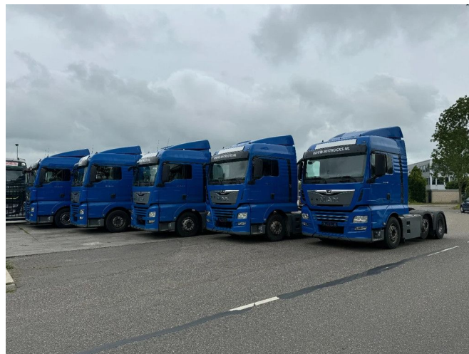
MAN TGX 26.460 XLX 6X2-2 EURO 6 LIFT AXLE