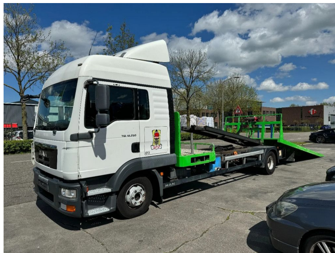
MAN TGL 12.250 4X2 EURO 5 + SCHUIFPLATEAU MET LIER...