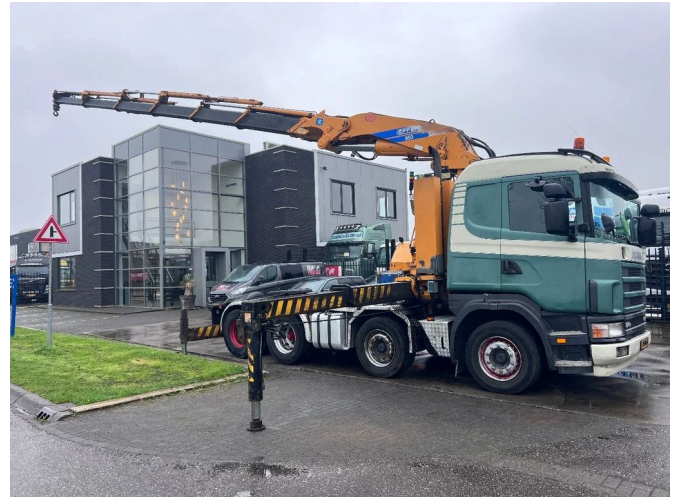
Scania R124-420 8X4 EURO 3 + EFFER 950/6S + 1 + REMOTE