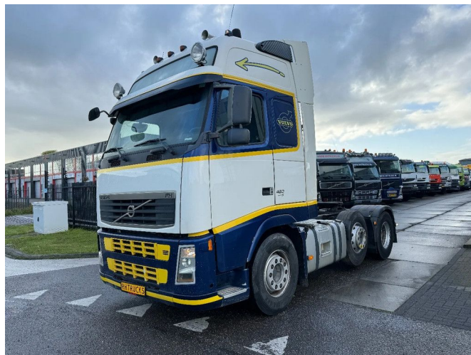
Volvo FH 480 6X2 EURO 5 + HYDRAULICS + STEERING AXLE