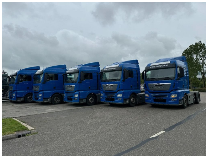
MAN TGX 26.460 XLX 6X2-2 EURO 6 LIFT AXLE