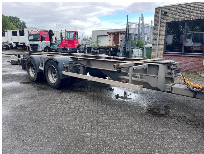
Sommer 2 AS - BDF CHASSIS - BPW AXLES