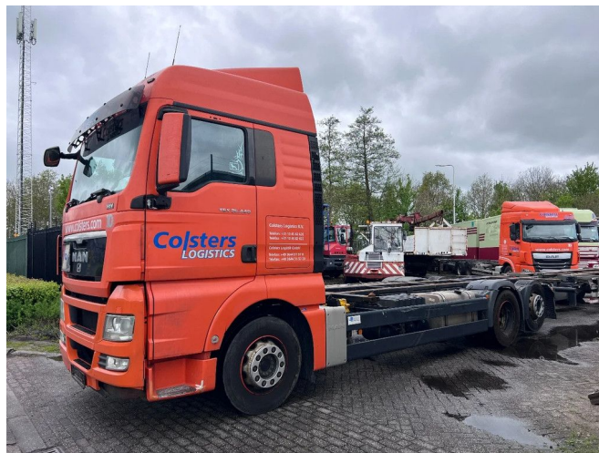
MAN TGX 26.440 XLX 6X2 EURO 5 - BDF CHASSIS + RET...