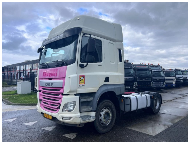
DAF CF 460 4X2 EURO 6 RETARDER + TIPPER HYDRAULIC