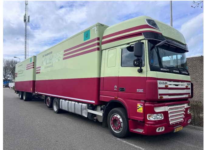
DAF XF 105.410 SSC 6X2 EURO 5 + FLIEGL 2 AXLE