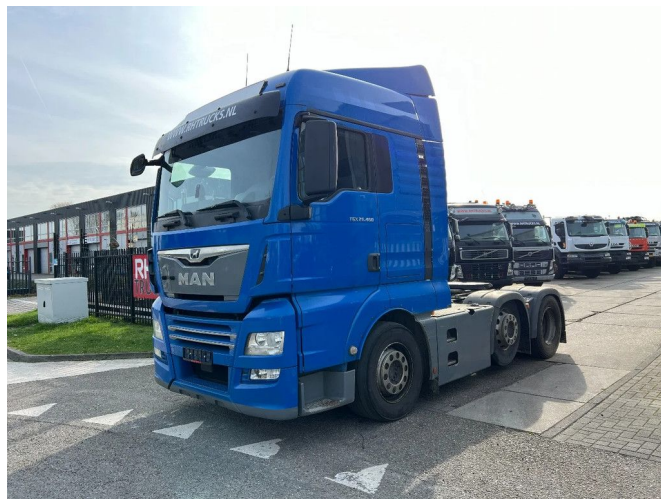
MAN TGX 26.460 6X2 EURO 6 + HYDRAULICS