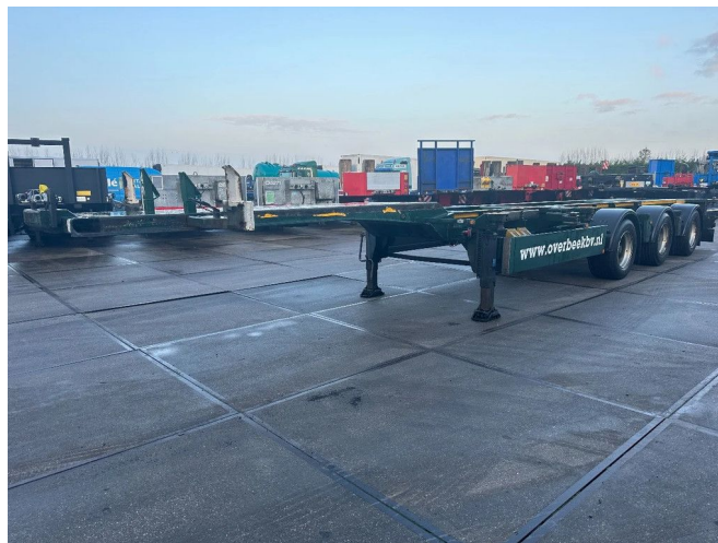
Renders 1 + 3e AXEL STEERING, LZV, 20,40,45 FT