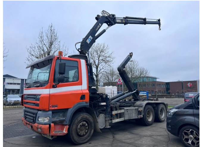
DAF CF 85.380 6X2 + MKG 141 A2 CRANE + 20 TON HOOK...