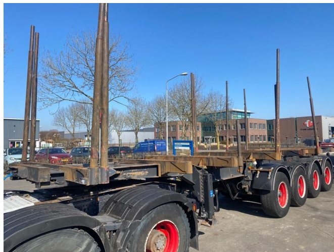
Doll 4 AXLE - BPW - WOOD / HOLZ / TIMBER TRANSPORTER