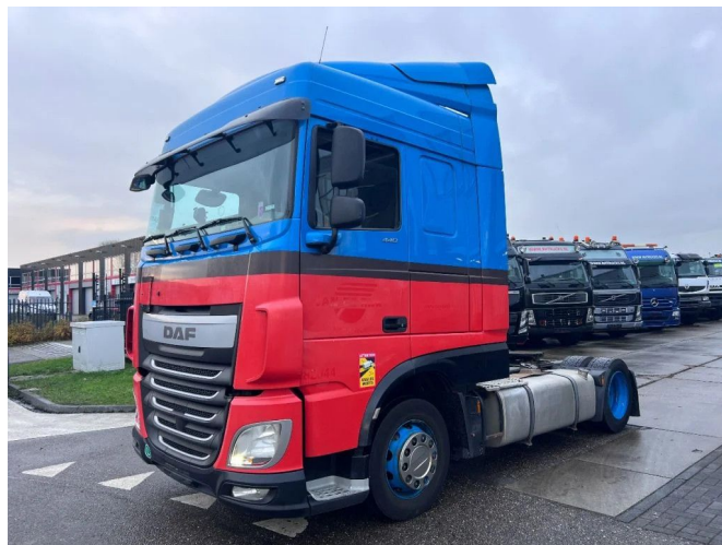
DAF XF 440 SPACE CAB 4X2 EURO 6 MEGA