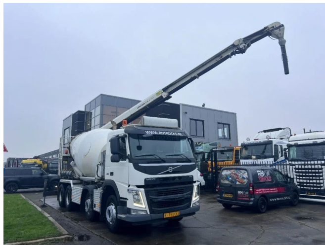
Volvo FM 410 8X4 MIXER 9m3 + LIEBHERR CONVEYOR BELT