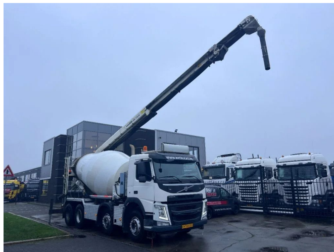
Volvo FM 410 8X4 MIXER 9m3 + LIEBHERR CONVEYOR BELT