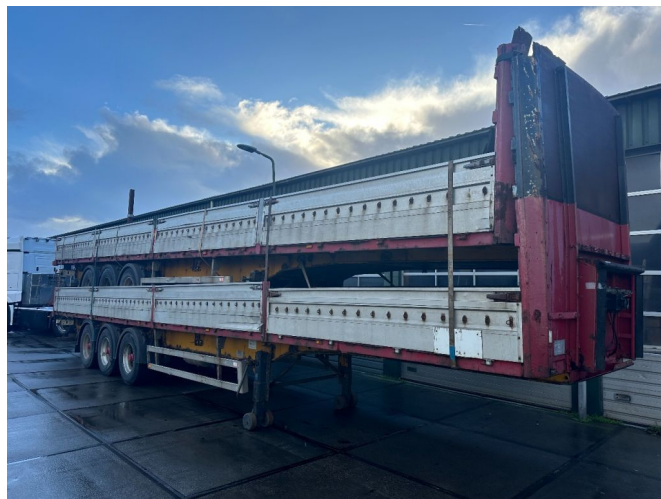
Pacton DRUM BRAKES, ALUMINUM SIDEBOARDS