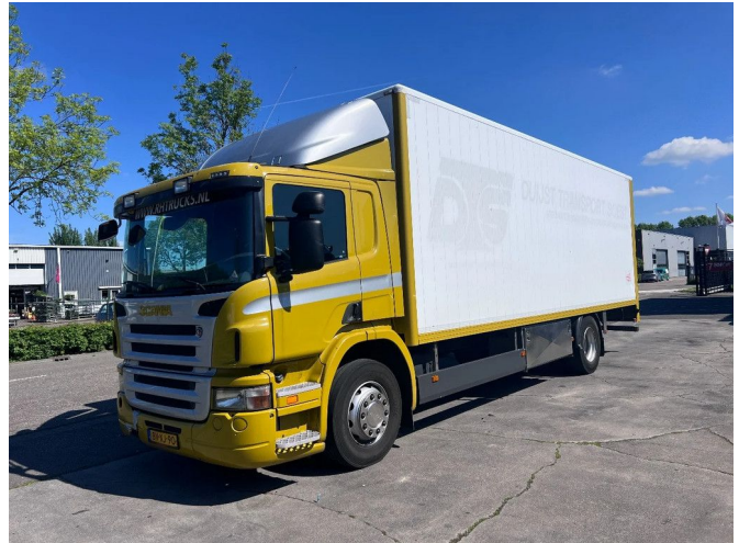
Scania P230 4X2 EURO 5 BOX 790x246x252