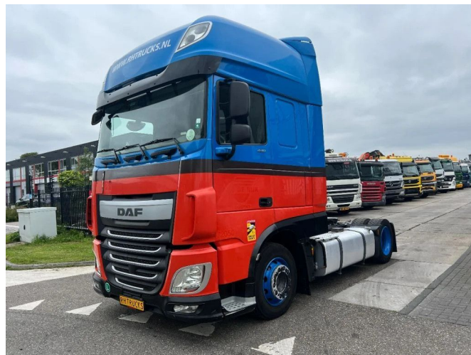
DAF XF 440 4X2 - EURO 6 - MEGA