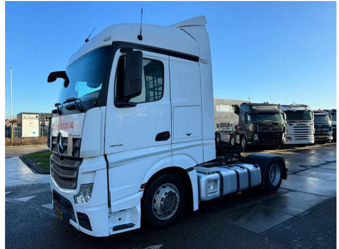
Mercedes-Benz Actros 1842 4X2 - EURO 6 + HEFSCHOTEL ...